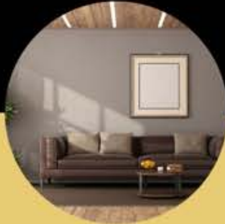
Photo Booth Sponsor